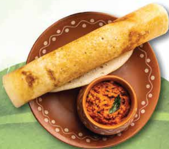
Tosai / Dosa