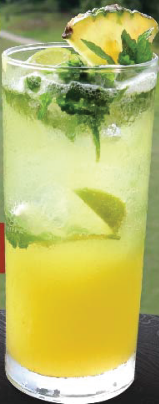
Virgin Pineapple Mojito RM12++