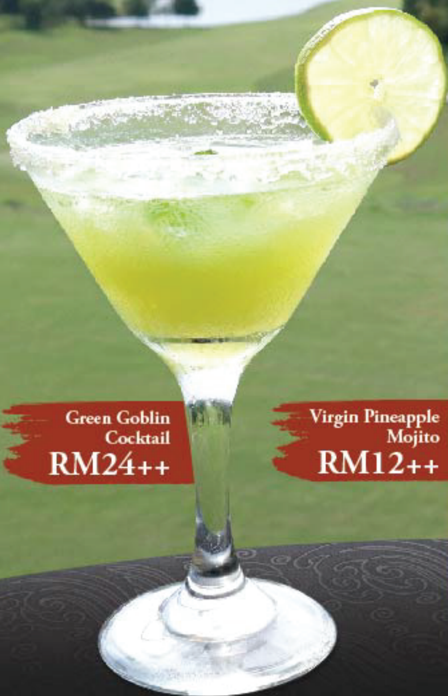
Green Goblin Cocktail RM24++